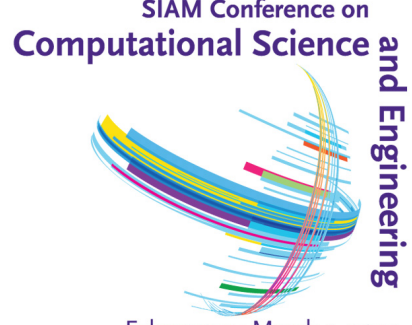
February 27-March 3, 2017 Hilton Atlanta, Atlanta, Georgia, USA