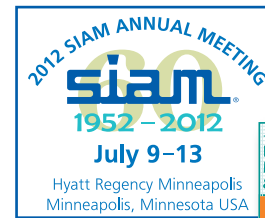
Exhibit Dates: July 9–12, 2012