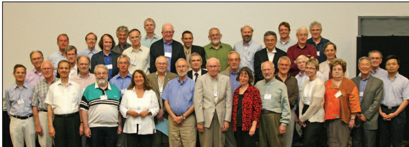
The first class of SIAM fellows was well represented at the SIAM Annual Meeting in Denver. Those available gathered for a historic photo after the prize lunch.