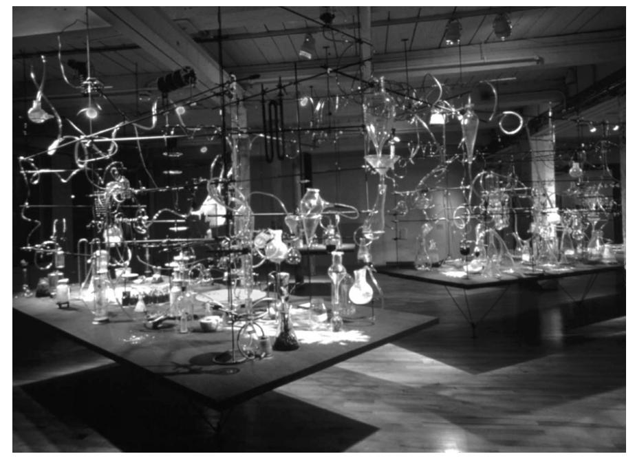
Eve Andrée Laramée's Apparatus for the Distillation of Vague Intuitions.

title. By "art" is meant traditional visual art: art with a big "A." Computer-generated art, one of the most significant incursions of technology into art is, alas, not covered.