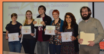
SIAM Student Chapter leaders receive certificates of recognition for their outstanding contributions.

Colorado College Colorado School of Mines Colorado State University Columbia University Community College of Rhode Island Cornell University Dartmouth College Delft University of Technology, Netherlands Delhi Technological University, India Drexel University Embry-Riddle Aeronautical University Emory University Florida Institute of Technology Florida State University George Mason University Georgia Institute of Technology Harvard University Harvey Mudd College Heidelberg University, Germany Heriot-Watt University & University of Edinburgh, UK Hong Kong Polytechnic University, Hong Kong Howard University Illinois Institute of Technology Imperial College London, UK Indian Institute of Technology-Guwahati, India Indian School of Mines, Dhanbad, India Indiana University-Purdue University Indianapolis Institut Teknologi Bandung, Indonesia Iowa State University King Abdullah University of Science & Technology, Saudi Arabia Louisiana State University Loyola Marymount University Massachusetts Institute of Technology Merrimack College