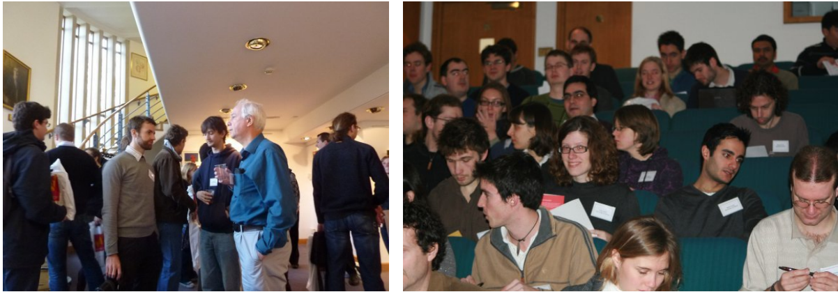
Figure 1: Left: registration before the first talk. Right: audience awaiting the talk by Ian Stewart.