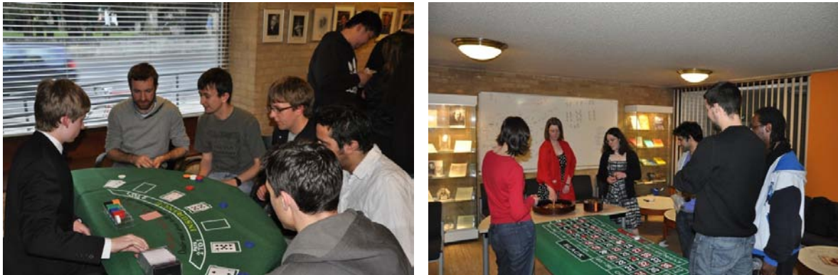
Figure 6: Black jack and roulette tables.