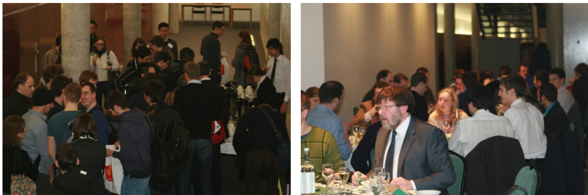
Figure 3: Left: discussions during coffee break. Right: conference dinner.